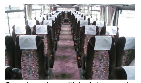
Cozy atmosphere with basic brown color