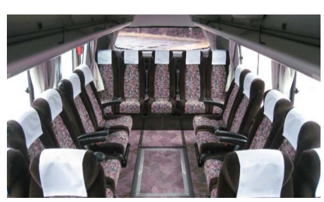
Back Seat Saloon Set Available